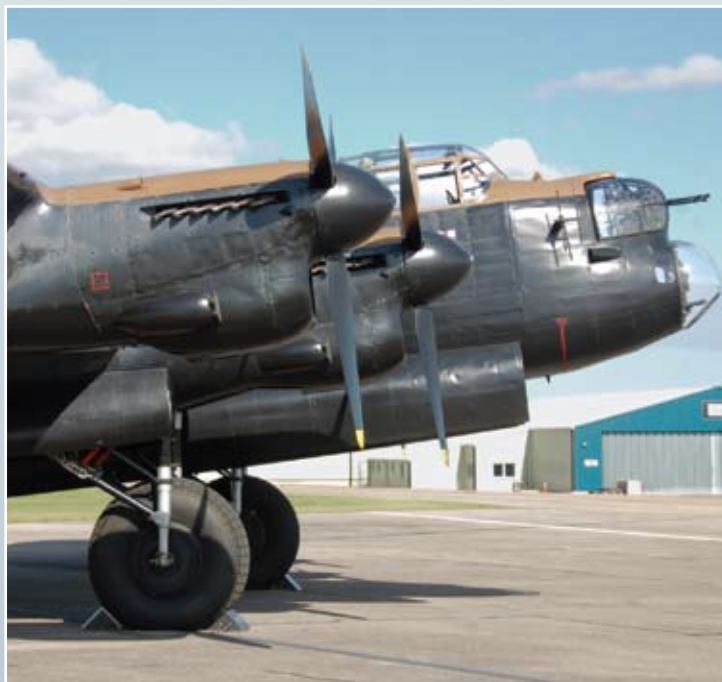
An Avro Lancaster Bomber

"I hope that the nature of this offence will prompt people who may have information to come forward or may even prick the consciences